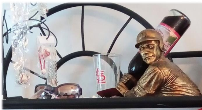
Fancy Nancy's loves the STL Cardinals!

If you are looking for unique recycled pieces, pay a visit to Cox's Rivertown Mill