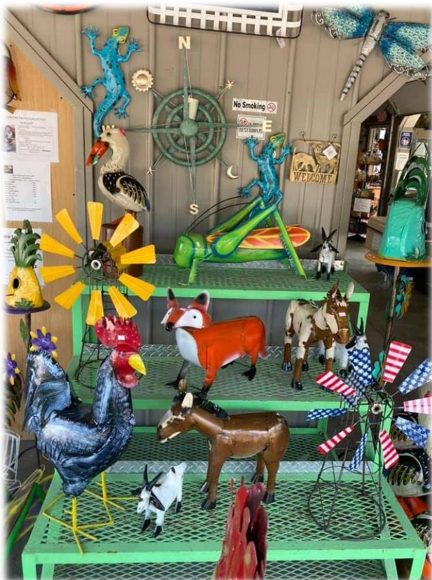
Shop Hideaway Farms Market for some new yard art.

Wild n' Crazy 301 E Main: Open on weekends.