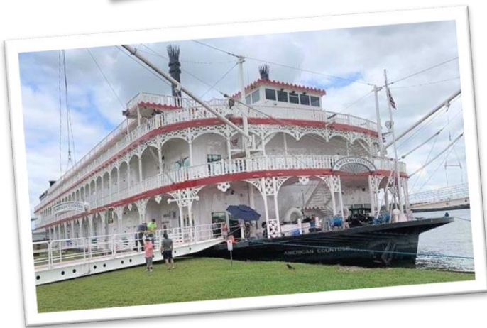
The big cruise boats made frequent stops in Grafton the past year including the new Viking boats The Countess and the Duchess.