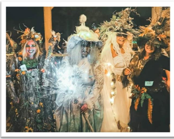
Witches on the Water 2022 had the biggest attendance ever & even more elaborate costumes.