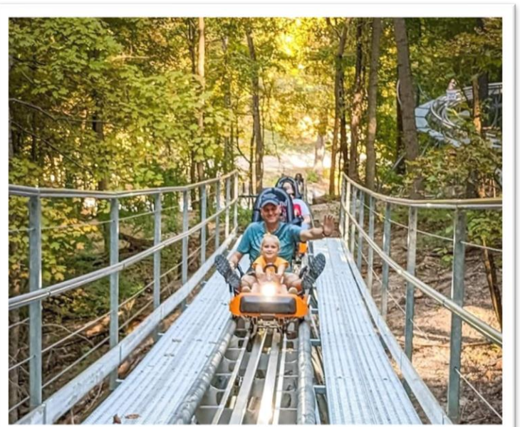
October saw the debut of the Aeries Alpine Coaster.