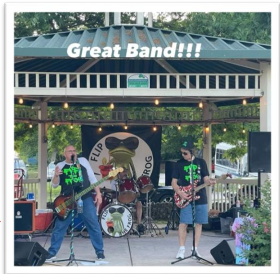
Flip the Frog performing during Music in The Park 2022.