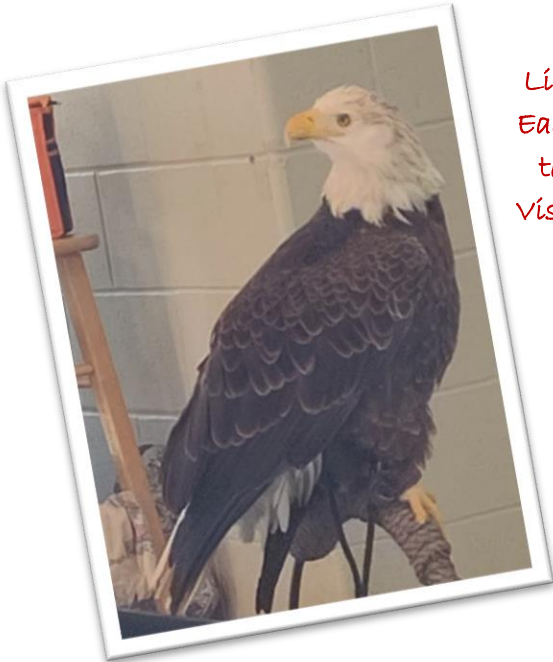
Liberty the Bald Eagle paid a visit to the Grafton Visitors Center in January.