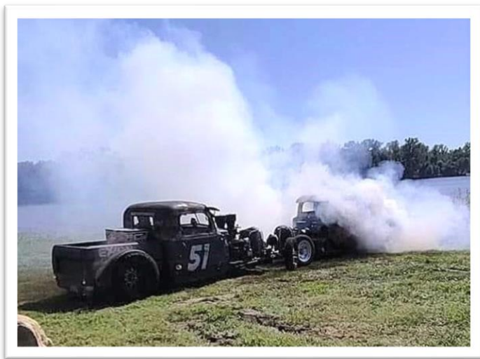
Wrenchfest 2022 at The Hawg Pit.