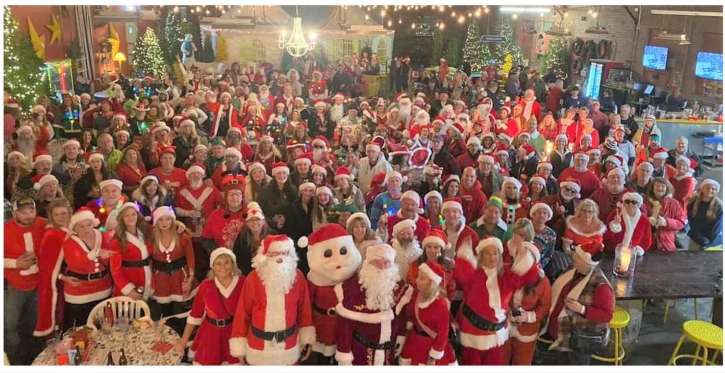
A new record attendance for Santa Con 2022. Everyone gathered for a group shot at the Loading Dock Ice rink.