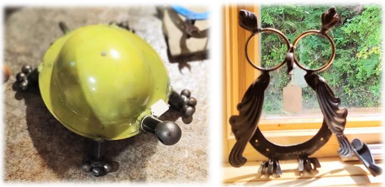
If you are looking for unique recycled pieces, pay a visit to Cox's Rivertown Mill