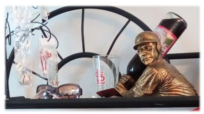
Fancy Nancy's loves the STL Cardinals!

Riverbank Gifts 225 E Main: Friday, Saturday, and Sunday 11am-5pm.