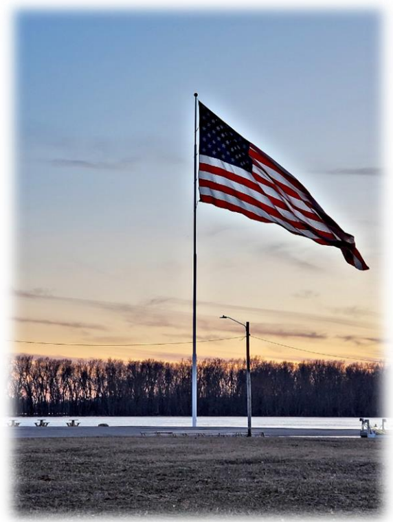
Saturday, September 11, 2021 8:30 am.

The City of Grafton & American Legion Post 648 will be holding a 9-11 ceremony by the large American Flag located on the Grafton riverfront honoring those who lost their lives 20 years ago.