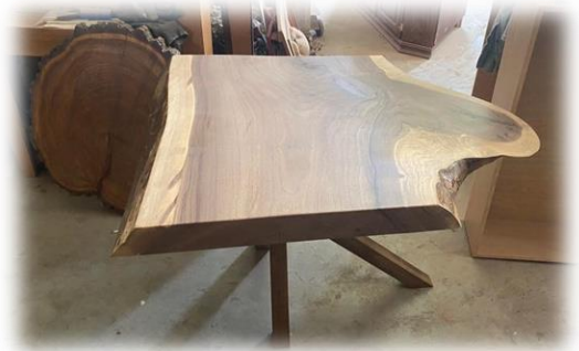
A custom table at Mosby Woodwork