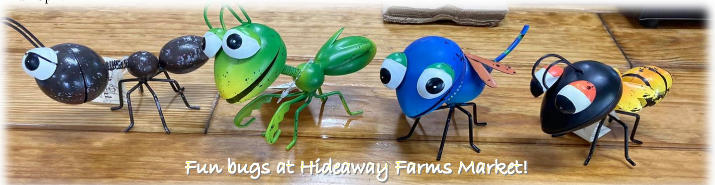
Fun bugs at Hideaway Farms Market!