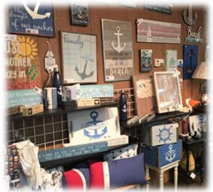
Nautical gifts and décor at the Grafton Harbor Marina Shop