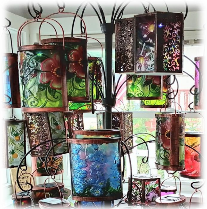
Beautiful Solar lamps at Fancy Nancy's on Main

Yellow Brick House 406 E Main: Open most days except Sundays 10am-5pm.