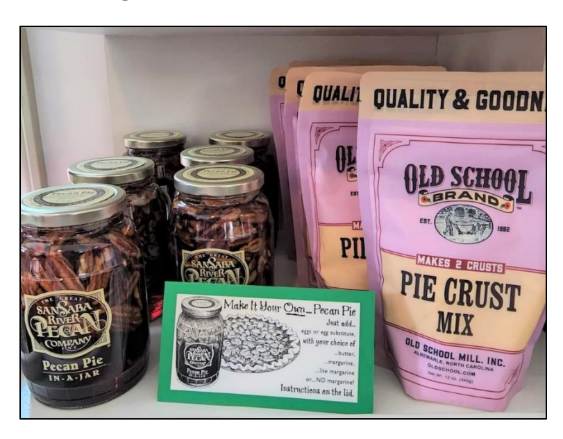
This unique Pecan Pie filling in a jar can be found at the new shop Main Street Gifts.

Hideaway Farms Market 1 East Main: Open daily from 10am-5pm.