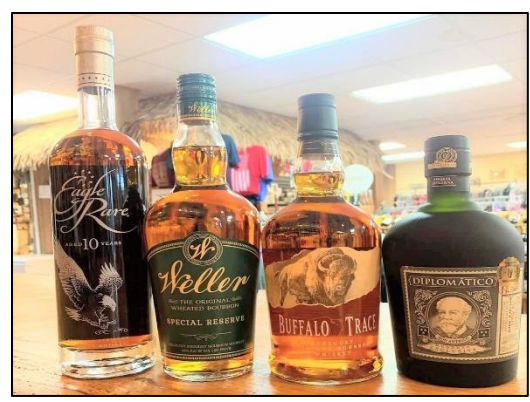
Yo Ho Ho and a bottle of rum or bourbon at the Grafton Harbor Marina Shop!

Wild n' Crazy 301 E Main: Open on weekends.