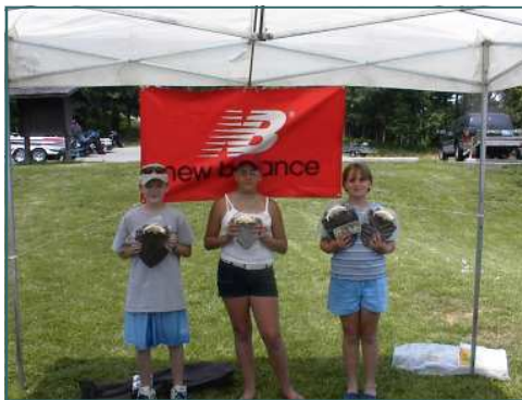
2004 Tournament Winners

Sponsored by the St. Charles County Hawg Hunters & the St. Charles City Parks Department