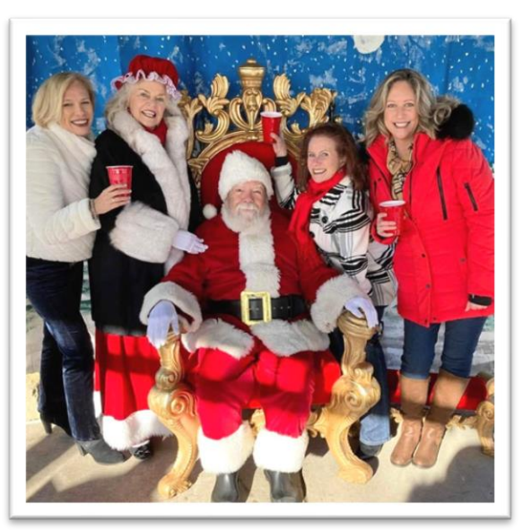
Mr. & Mrs. Claus and friends get together for a group shot during Santa's Chocolate Express.

The 5-ton military truck decorated by Lady Luck Designs § Photography gets in the line up for Grafton's 2<sup>nd</sup> Lighted Christmas Parade.