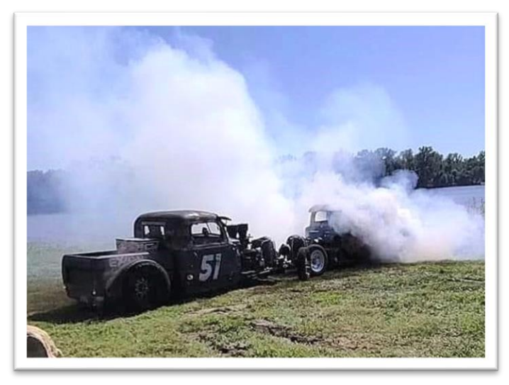
Wrenchfest 2022 at The Hawg Pít.