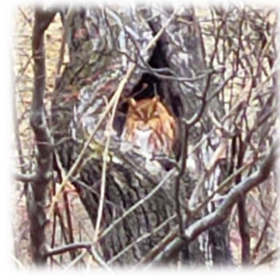
The little Screech Owl that hangs out at The Edward Amburg History Museum & Visitors Center is also a big attraction during eagle watching season