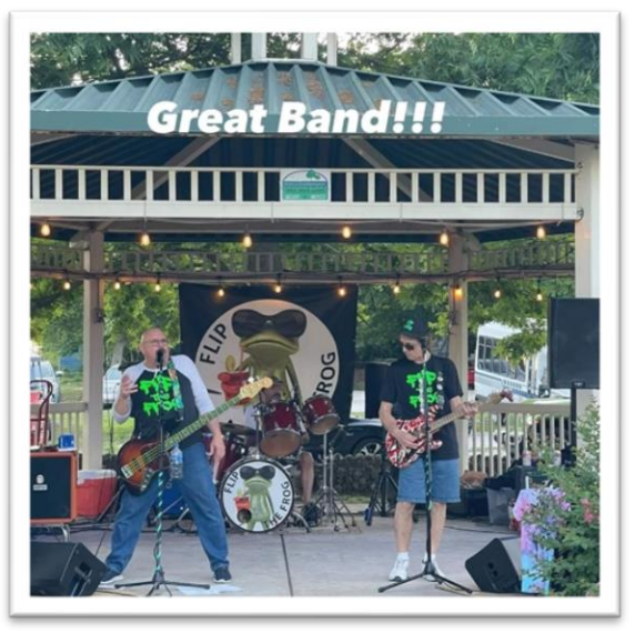
Flíp the Frog performing during Music in The Park 2022.

The Grafton fireworks lit up the sky again at Lighthouse Park