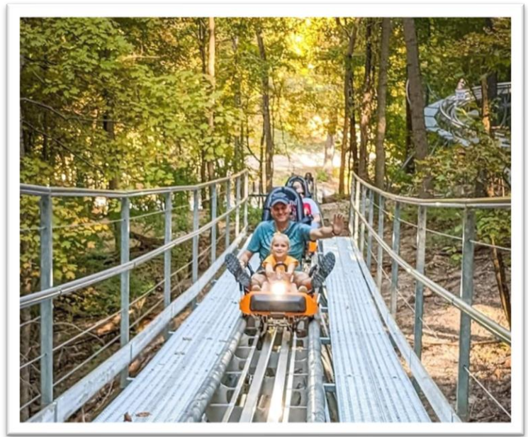
October saw the debut of the Aeries Alpine Coaster.